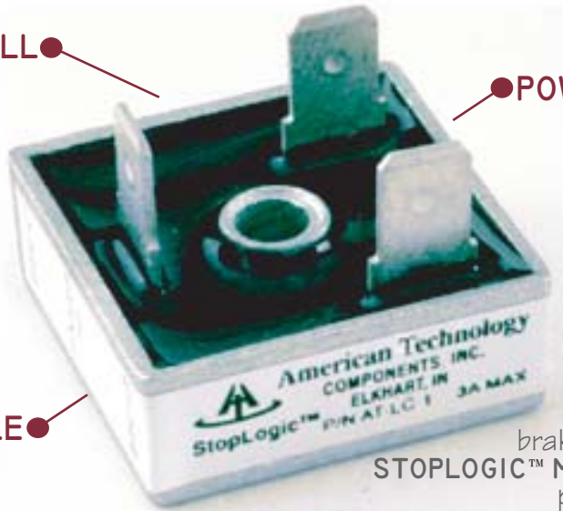
brake lamp STOPLOGIC™ MODULE p/n AT-LC-1